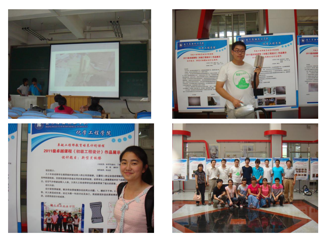
Figure 2. Project defense and the exhibition of posters and products