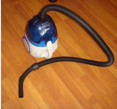
Figure 3. Tentative plan of the vacuum blackboard eraser project