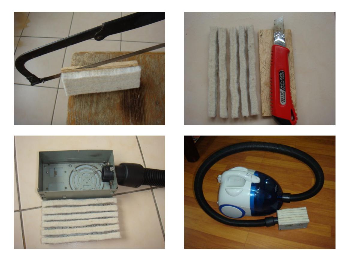
Figure 4. Implementation of the project