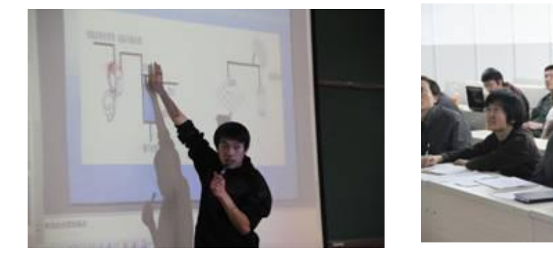
Figure 1. Proposal presentation

Three check points are set to ensure they are maintaining progress and also to develop their writing and presentation skills. The first check point comes in the 8th week. Students need to make a proposal presentation in groups to state the background, objective, plan, key issues and approaches of their projects. Their advisers are invited as the committee members to give suggestions, feedback and comments on their proposals. All the teams are divided into three big groups to take turns to give presentation in three classrooms, separately, and each group has five committee members (Figure1). Before the presentation, the documented project proposal should be submitted to the committee members. The presentation can be given by either only a team member or four of them together. After presentation, committee members are required to give the group assessment based on not only the technical content, but also the writing, presentation and communication skills.