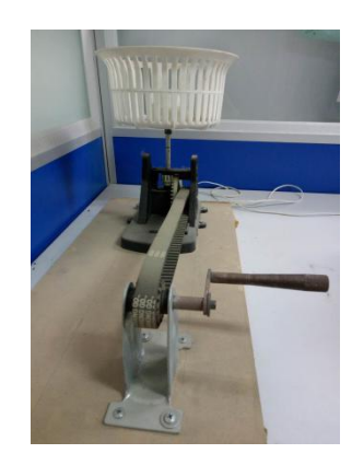
Figure 7. Pictures of the completed manual spin dryer