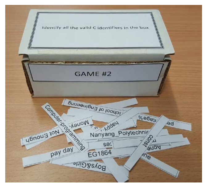
Figure 1. Competitive Game to identify the correct C identifiers

In the second game, a box containing many C identifiers as shown in Figure 1. Students were required to pour out all the given identifiers and identify the correct C identifiers. There was no information given on the total number of correct C identifiers present in the box.