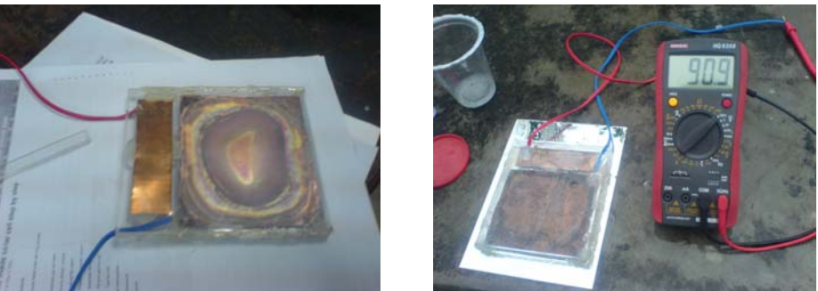
Figure 1. Solar Photovoltaic Cell (left) and Testing of the Cell (right)

1. Solar Photovoltaic Cell: this project involved fabrication and testing of a copper-cuprous oxide photovoltaic cell. A copper plate heated on a hot plate resulted in the formation of a fine cuprous-oxide layer on the surface of the copper plate. The plate was then mounted in a case filled with a water / baking soda mixture. An electrical circuit was completed through the addition of a second copper plate, with the completed cell shown to the left in Fig. 1. This project was relatively simple and provided a gentle introduction for the students to both the workshop and the nature of the implement-operate projects. Learning Outcomes: mechanical design; photo-voltaic effect in a copper-cuprous oxide thin-film solar cell; simple soldering; efficiency estimation.