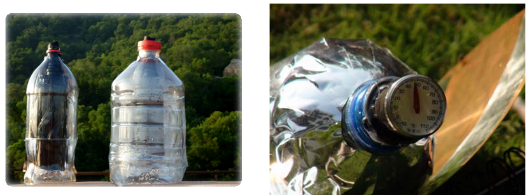
Figure 4. Solar-thermal water heater designs (left) system testing (right)

4. Solar-Thermal Water Heater: this project involved the fabrication and testing of solar-thermal water heater that mimicked the performance of an evacuated tube collector. Students fabricated the water heater using nested plastic bottles. Reflective tape was used to increase the concentration ratio of the collector. A simple child thermometer was used to measure the temperature of the water within the heating section, as shown to the right in Fig. 4. This was the simplest project and it was placed at the end of the course during the week with the least amount of time for the Practicum course. The students were skilled in the workshop by the final week and consequently the building phase of the project was completed in the first day. Learning Outcomes: mechanical design; solar-thermal energy systems; efficiency estimation.